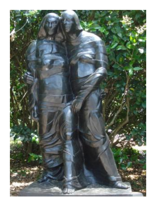
Leonard Baskin, 1979 USA